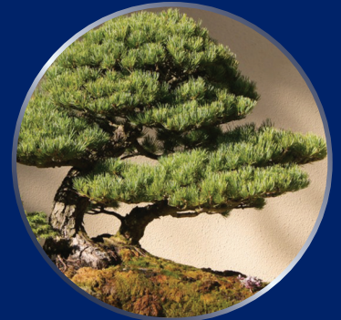
Pacific Bonsai Museum